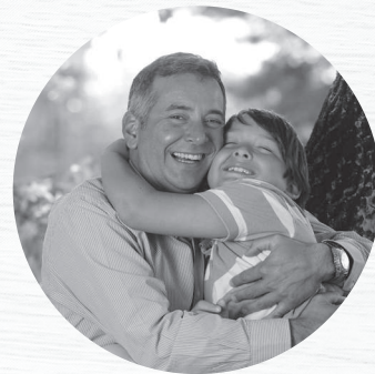
2003 CAMPAIGN FOR RECOVERY $11 MILLION