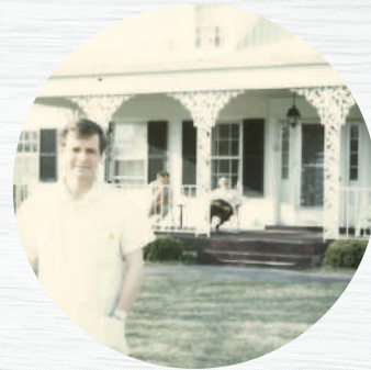
1981-2017 CUMBERLAND HEIGHTS ENDOWMENT $3.8 MILLION