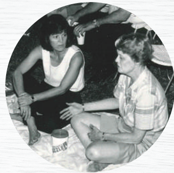
1974 WOMEN'S CENTER CAMPAIGN $335,000