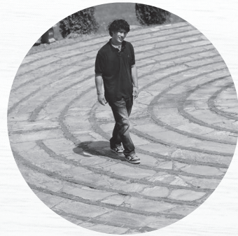
2011-2017 REACHING NEW HEIGHTS $650,000