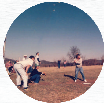
1996-2017 CONCERT FOR CUMBERLAND HEIGHTS $3.1 MILLION