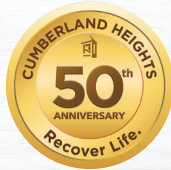
2016 50 TH ANNIVERSARY CAMPAIGN $980,000