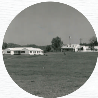
1982 CAMPUS EXPANSION CAMPAIGN $2.2 MILLION