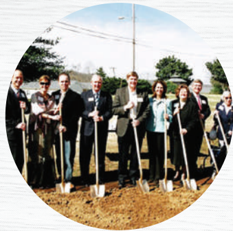
1965 BREAKING GROUND CAMPAIGN $284,000