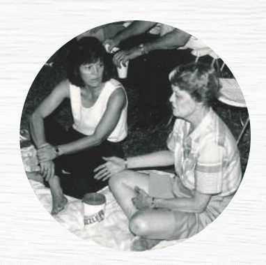
1974 WOMEN'S CENTER CAMPAIGN $335,000