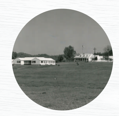
1982 CAMPUS EXPANSION CAMPAIGN $2.2 MILLION