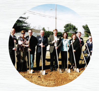
1965 BREAKING GROUND CAMPAIGN $284,000