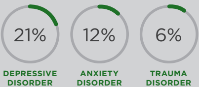
Male Co-Occurring Diagnosis